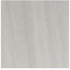
Olmo sbiancato 2E