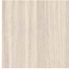
Olmo chiaro 0V