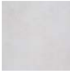
Spatolato chiaro 2H