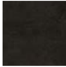
Spatolato Scuro 2J